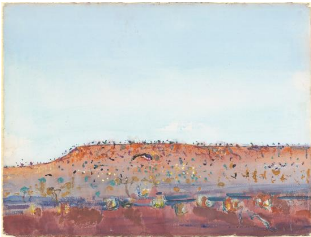
Fig. 2. Fred Williams, Aboriginal Cave, Rocklea , 1979. Gouache, 57 x 75 cm, Melbourne, National Gallery of Victoria, acc. no. 2001.611. Presented through the NGV Foundation by Rio Tinto, Honorary Life Benefactor, 2001. (Estate of Fred Williams.)

A second way of reading the distance that McCaughey recognised in Williams' relationship to, and treatment of, his landscapes, and that Williams himself admitted to, is to turn to the political conflicts of his day. In particular, it is possible to turn to