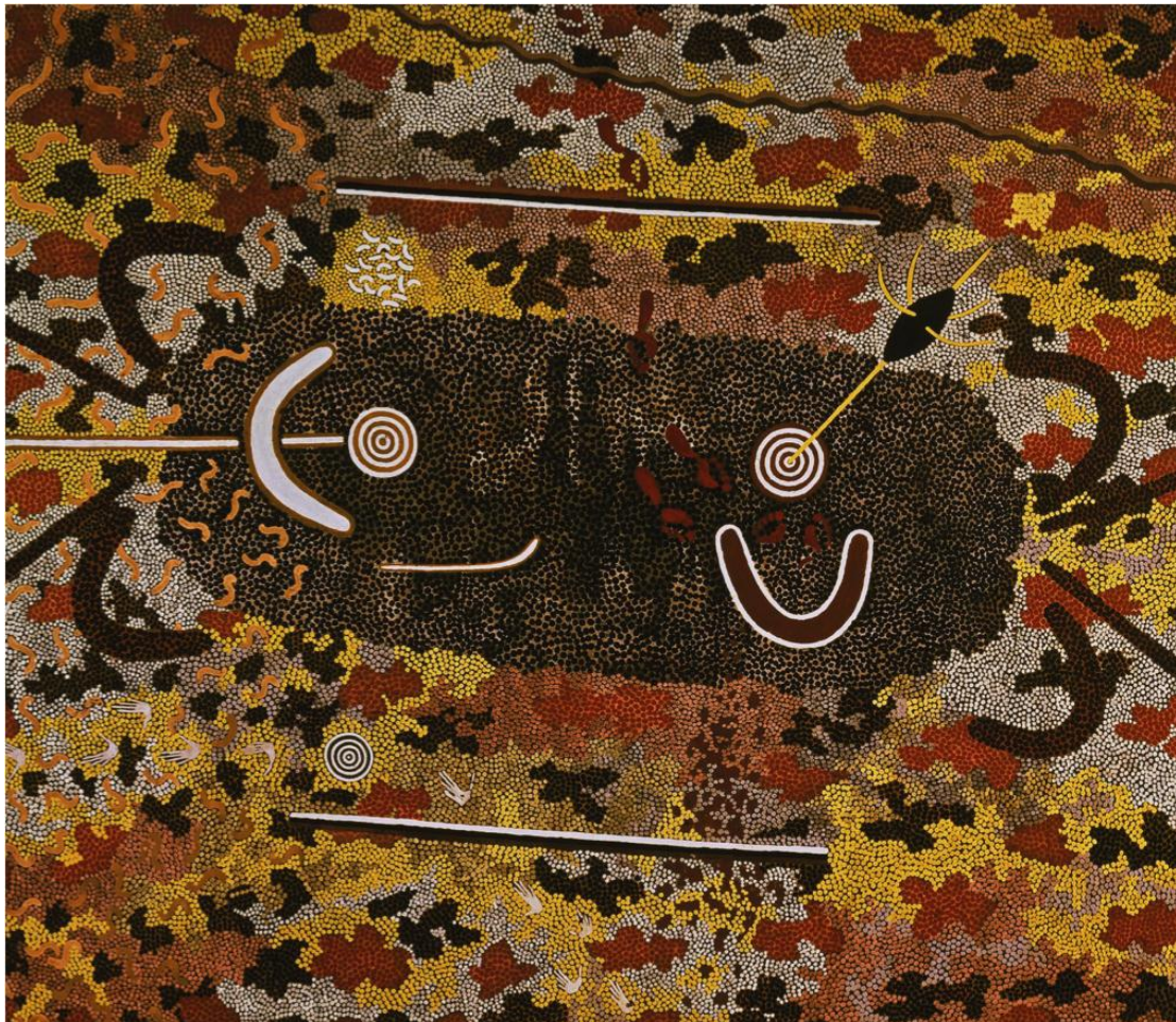
Fig. 5. Clifford Possum Tjapaltjarri, Man's Love Story , 1978. Synthetic polymer paint on canvas, 217 x 261 cm, Adelaide, Art Gallery of South Australia. Visual Arts Board, Australian Contemporary Art Acquisitions Program 1980. (Estate of Clifford Possum Tjapaltjarri.)

comparison between the similarity of the suburbs and the Australian landscape. He notes that ‘there’s no difference between the suburban landscape or the outer-suburban landscape and the top coast of West Australia . . . that expression “landscape with the skin off” is [not] just referring to the desert. It’s all basically the same.’ 38 Such similarities betray a way of seeing produced out of a distance from the landscape, a distance that urban living brings about in Australia.