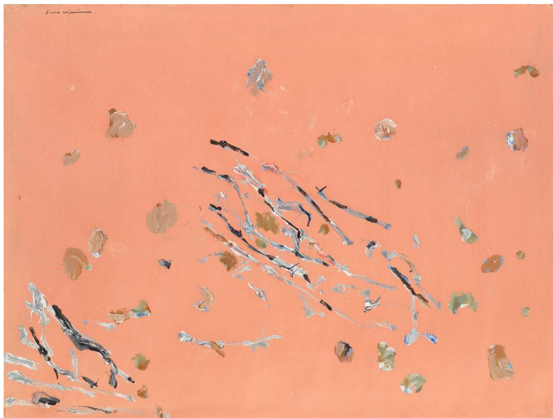
Fig. 3. Fred Williams, ( Aboriginal Graves 1 ), 1967-69. Gouache, 57.2 x 76.2 cm, Canberra, National Gallery of Australia, inv. No. 1983.2989.42. Purchased from Gallery admission charges 1983. (Estate of Fred Williams.)