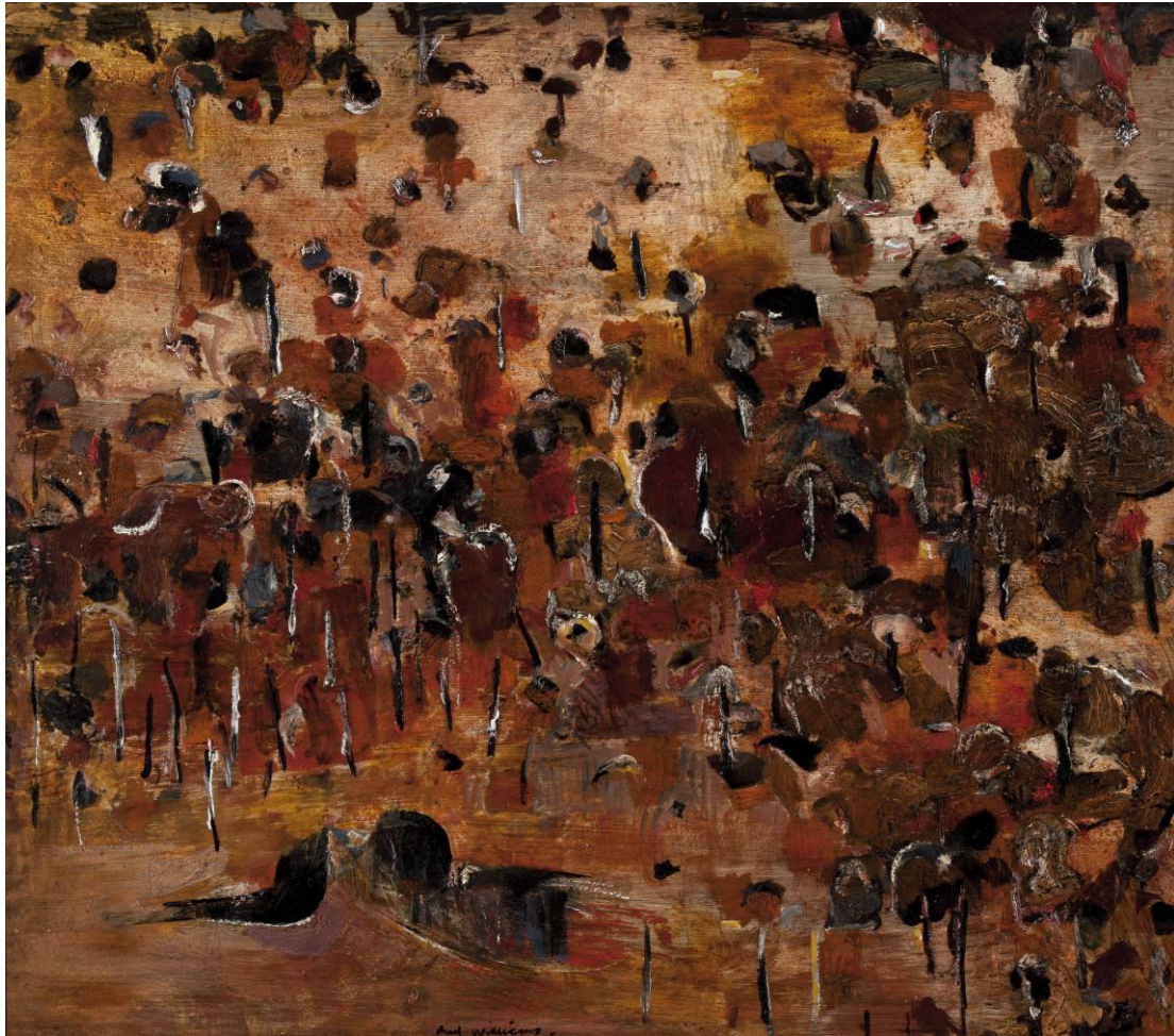
Fig. 4. Fred Williams, You Yang Pond , 1963. Oil on composition board, 116.3 x 132.8 cm, Adelaide, Art Gallery of South Australia. Gift of Godfrey Phillips International Pty Ltd, 1968. (Estate of Fred Williams.)

comparable to Possum's own, as this artist distils the Dreaming and its relationship to vast tracts of the desert. The flatness of Possum's work, too, creates a critical