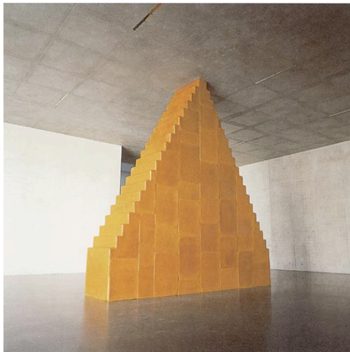
Wolfgang Laib, Ziggurat 1999, beeswax, wood, 460 x 450 x 130 cm, Collection of ifa Stuttgart

WL: Oh, that's fine. [Transcendence] is fine. Also, you can find many articles that compare my pollen pieces with Rothko's paintings and I was never so happy about this because, as I just told you before, a pollen piece is not a painting. It is not about colour, and Rothko was really mainly interested in colour. I mean, there is certainly a connection but it's not between the [feathered] edge of the pollen piece and the edges of Rothko's paintings. I think the connection is more that he was striving and hoping for the same thing as I. But the visual similarities, they are very different. But you can find many articles that say the pollen piece is a Rothko on the floor.