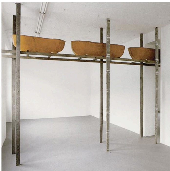
Wolfgang Laib, Passageway-overgoing 1996, 7 beeswax ships, wood construction, 350 x 70 x 1033 cm, Collection of ifa Stuttgart, Image courtesy of the Lawrence Wilson Art Gallery, University of Western Australia.

WL: I am not so old but I am also not so young any more, so I have survived this fashion or that fashion in the art world somehow. What I feel very uncomfortable with is that recently fashions are changing faster and faster and that is a pity, a real pity. I can be very tolerant, as long as there are many different possibilities (and there are still many different possibilities and many different ways of looking at things) but when art becomes a fashion show that is a pity. Many artists do this. When you look back in history there were always many artists doing the same and some artists who did the opposite, something totally different. There are many artists who don't know what to do, so they just do what the others do, and there are many curators and museum directors that just do what the others do. That's pretty weak.